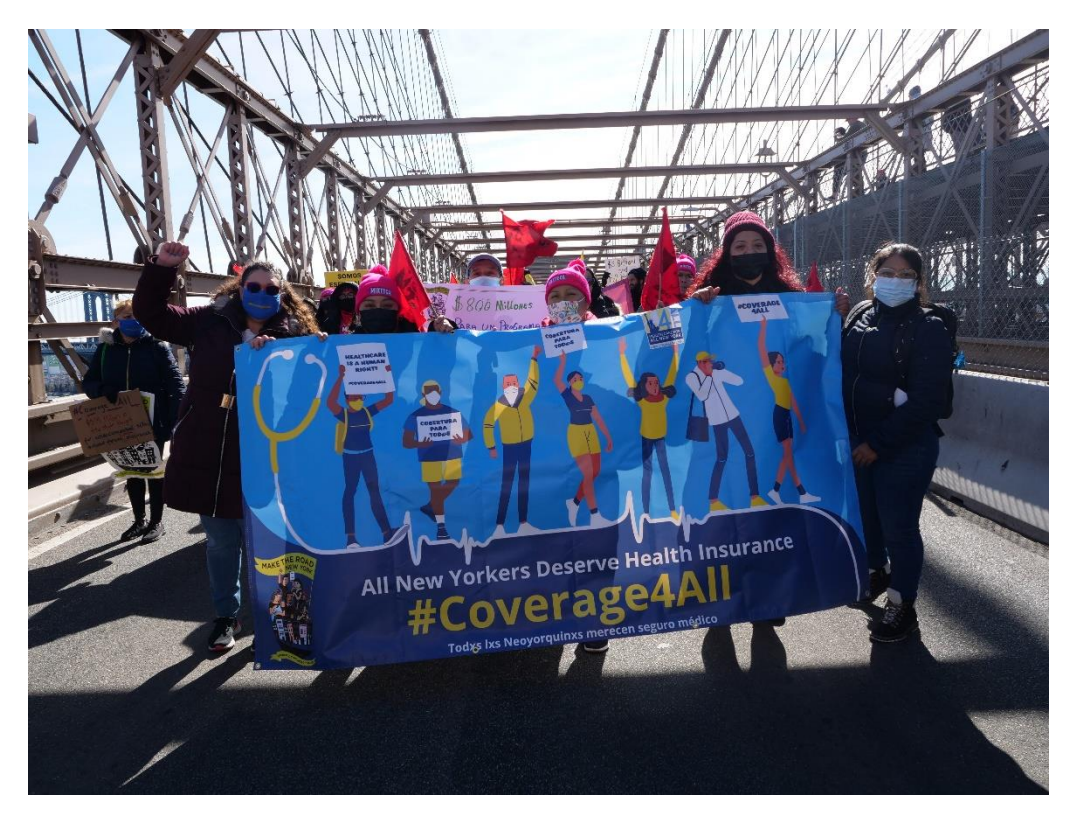
Covid-19 Impact on Household Cleaners in NYC

The Coverage4All coalition, and the cleaners from our study, are urgently demanding that Governor Kathy Hochul and the New York legislative leaders include the #Coverage4All(A880A/S1572A) bill in the FY23 NYS budget , which would expand lifesaving health coverage to undocumented immigrant New Yorkers. Our study provides data to support the need for these programs.